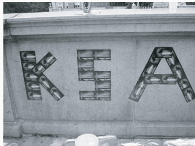
Brilliant and innovative KSA advertisements