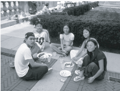
KSA members relaxing at the KSA anual BBQ